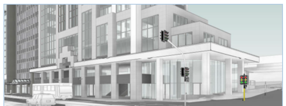
Figure 4. Artist's impression of Victoria St cut back canopy