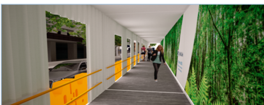
Figure 3. Artistic impression of container walkway